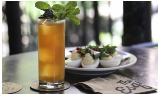
Libations from The Esquire

Ocho (Cuban/Mexican at Hotel Havana) Havana Bar (at Hotel Havana, closed Sun-Tues) The Moon's Daughters (rooftop lounge of the Hyatt) The Esquire (Southern, longest wooden bar in TX) Tokyo Cowboy (Asian/Southern Fusion) Hugman's Oasis (Tiki bar) Haunt Lounge (in Hotel St. Anthony, closed Sun-Mon) Francis Bogside (Irish Pub) Domingo (elevated South Texas) The Bunker Mixology (closed Sun-Tues) Boudro's (Texas Bistro) Acenar (Modern Tex-Mex) Make Ready Market (Food hall, various choices!) Schilo's Deli (German/Texas Diner, breakfast & lunch)