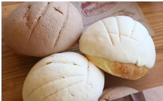
Concha pan dulce from La Panaderia

Maverick Whiskey (5 min walk from Tobin) Devils River Whiskey (7 min walk from Tobin) Road Map Brewery (5 min drive from Tobin) Alamo Beer Company (5 min drive from Tobin)