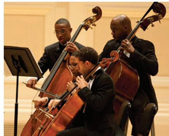
Caption goes here