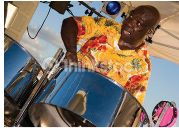
Caption goes here