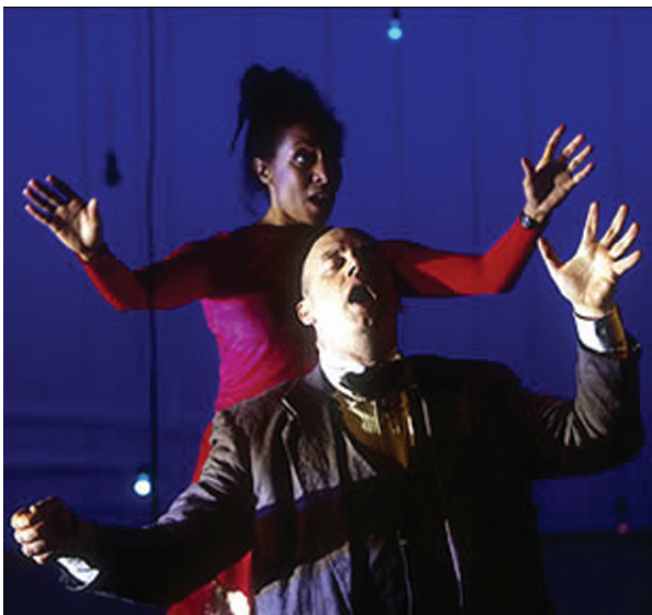
Caption goes here

The CPAE program helps build a platform from which you can better negotiate and build your career success. The CPAE program sets demonstrable standards for our industry; raises its profile and allows you, as an important part of the industry, to achieve your goals in an increasingly competitive field.